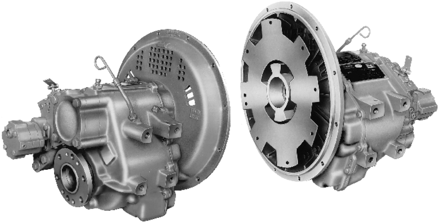
MG-5061A shown with optional torsional coupling and mechanical selector valve

From the family of Twin Disc critical performance products