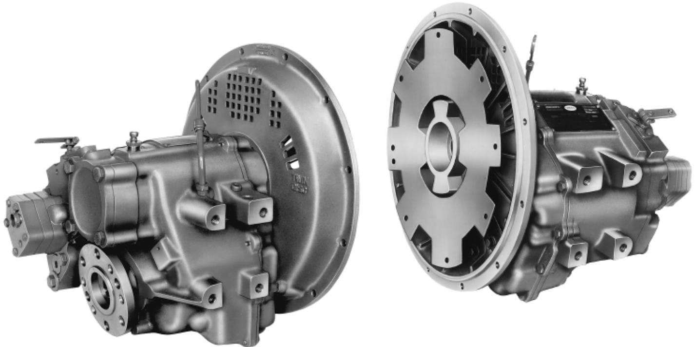
MG-5050A shown with optional torsional coupling and standard mechanical selector valve

From the family of Twin Disc critical performance products